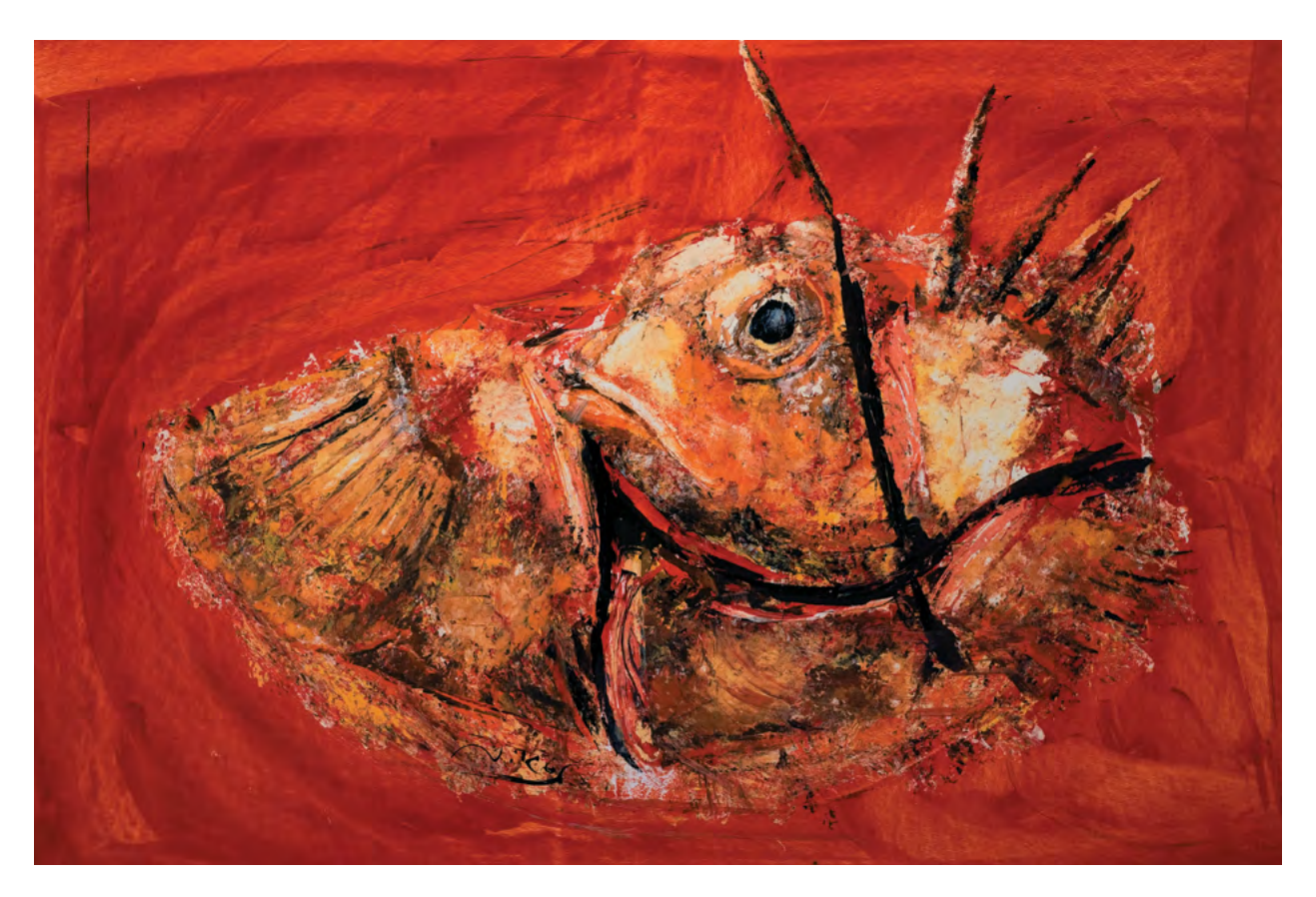
Nikos Kypraios Fish Oil on paper | 70 x 100cm | 2010