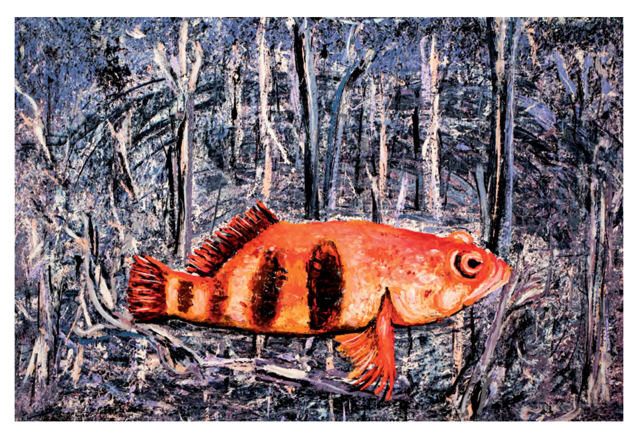
Nikos Kypraios Fish Oil on paper | 70 x 100cm | 2010